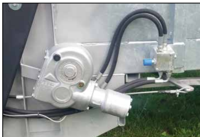
Hydraulic towing with speed regulation valve