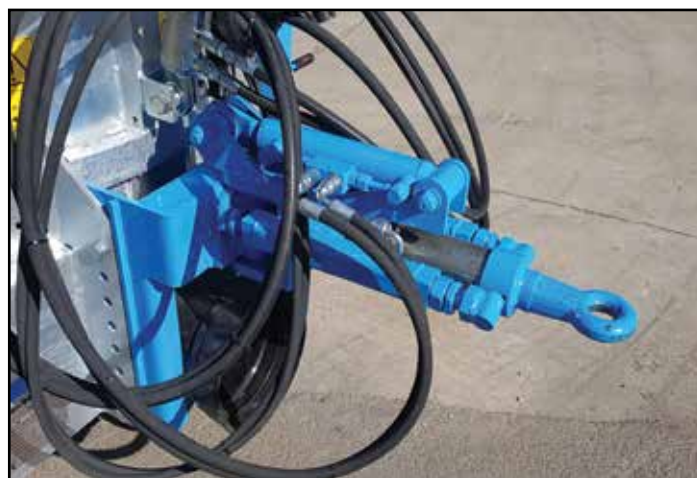
Hydraulic steering drawbar