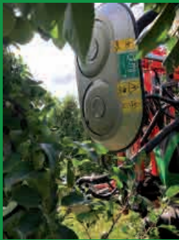
PRECISION AIR SYSTEM