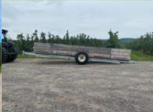
Model 2 (single wheel) Tilted