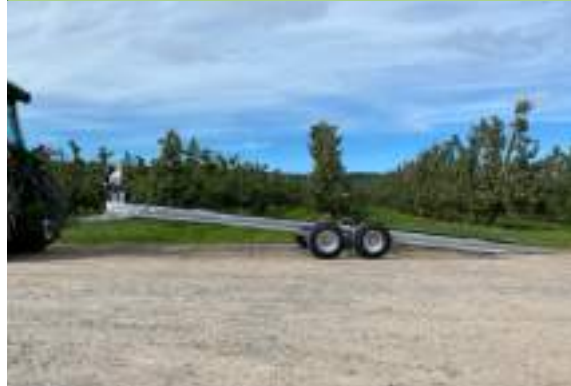
Model 1 (tandem wheel) Tilted