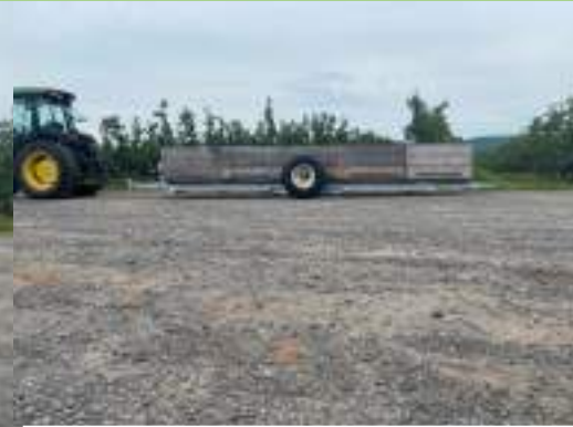
Model 2 (single wheel) Lowered