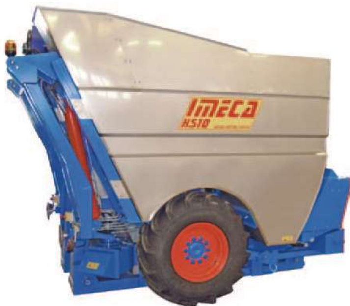
Trailed Grape Harvester HS10