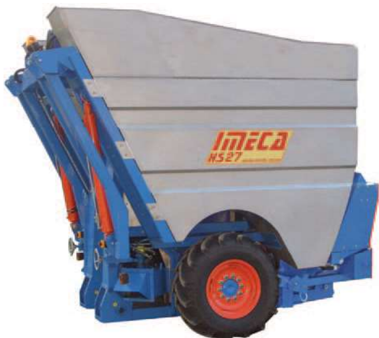
Trailed Grape Harvester HS27